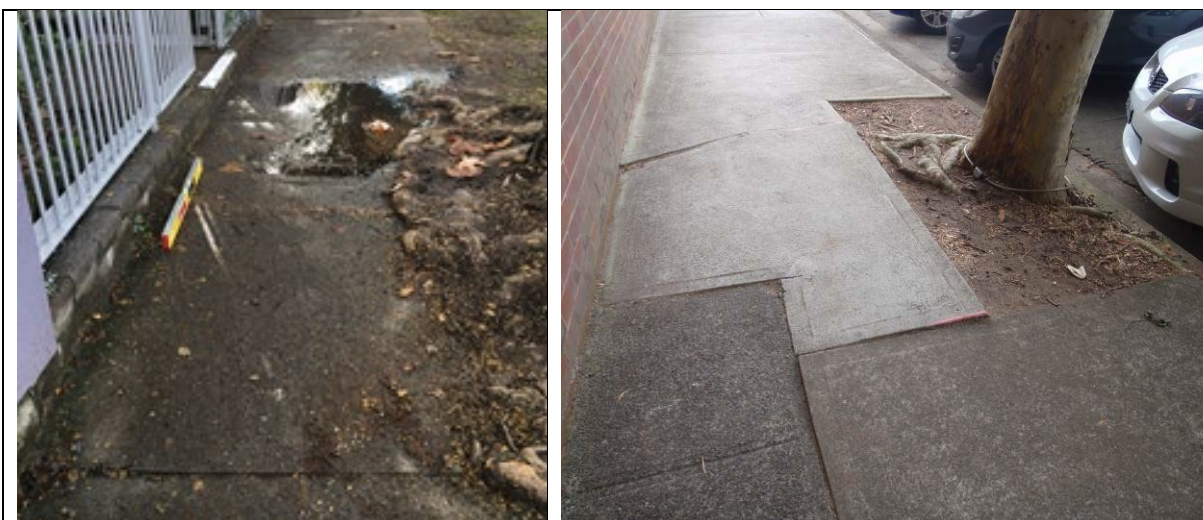
Tree root affected concrete footpath including ponding