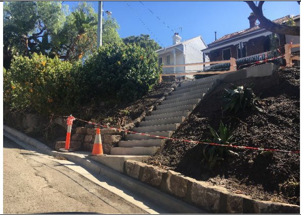
Doris Street, North Sydney – After