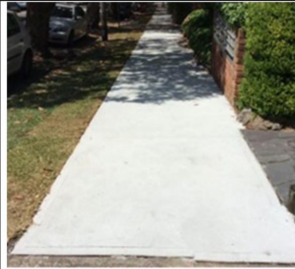
Morton Street, Waverton