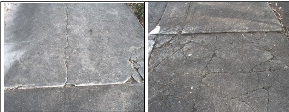
Concrete footpath in poor condition