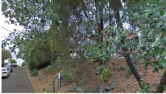
Doris Street, North Sydney – Before