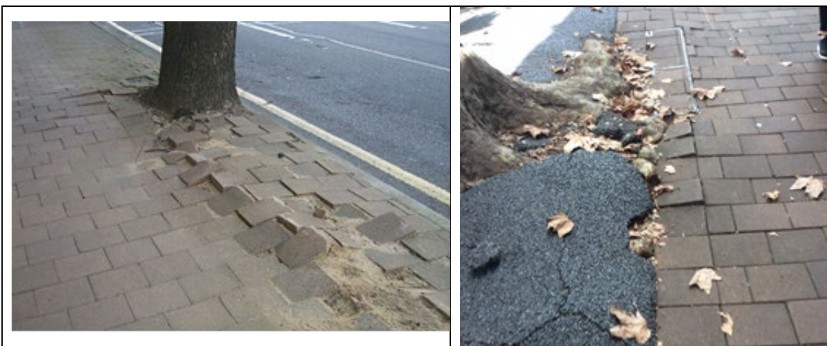
Tree root affected pavers and tree site infill