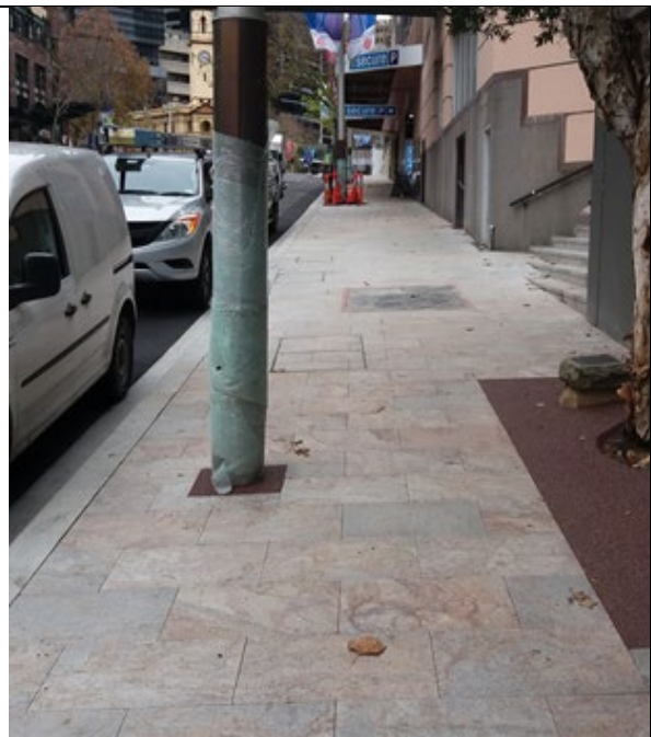
Pacific Highway, North Sydney – Mount Street to Walker Street