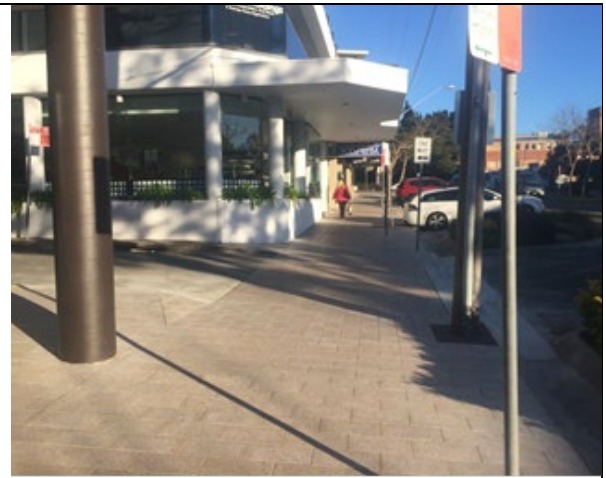
Grosvenor Street, Neutral Bay – Before and After