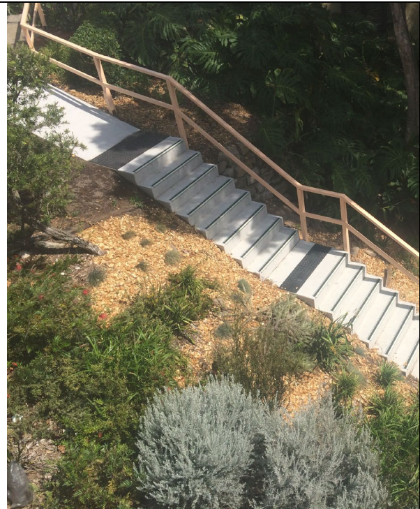
Peel Street, Kirribilli – After