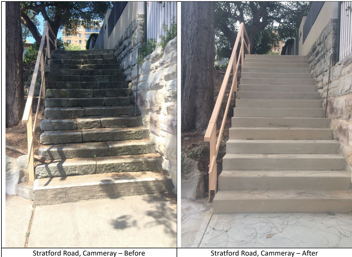
Stratford Road, Cammeray – Before