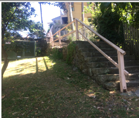
Carr Street, Waverton – Before