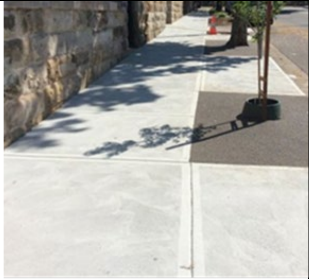
Walker Street, North Sydney