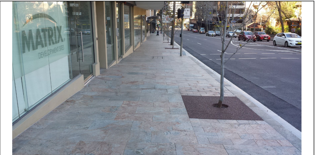
Pacific Highway, North Sydney – Granite