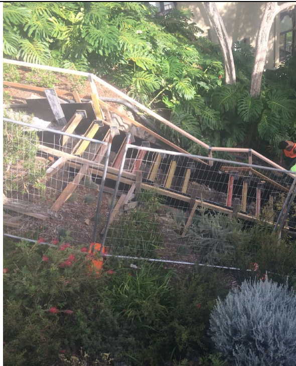
Peel Street, Kirribilli – Before