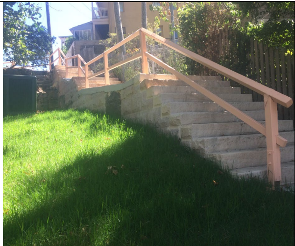
Carr Street, Waverton – After