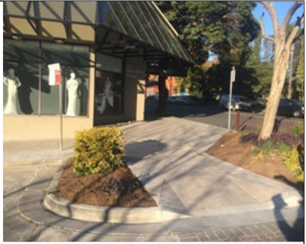
Grosvenor Street, Neutral Bay - Pebblecrete