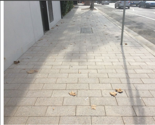
Alexander Street, Crows Nest – Pebblecrete