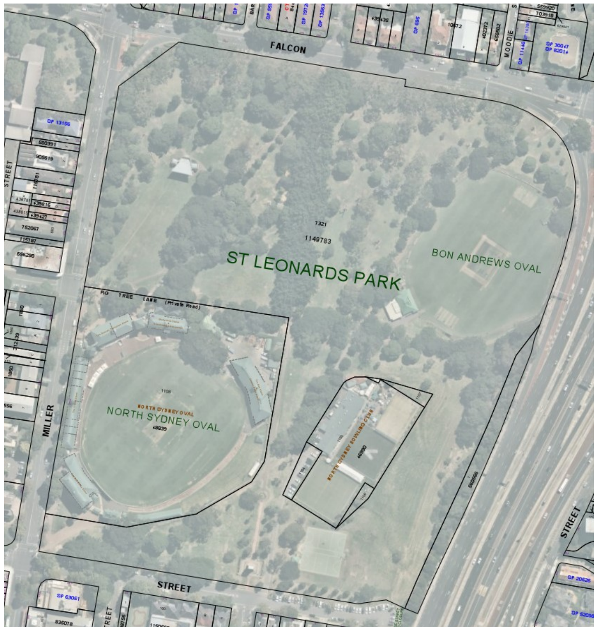
Map 1 – Aerial Photograph of St Leonards Park, including cadastral information