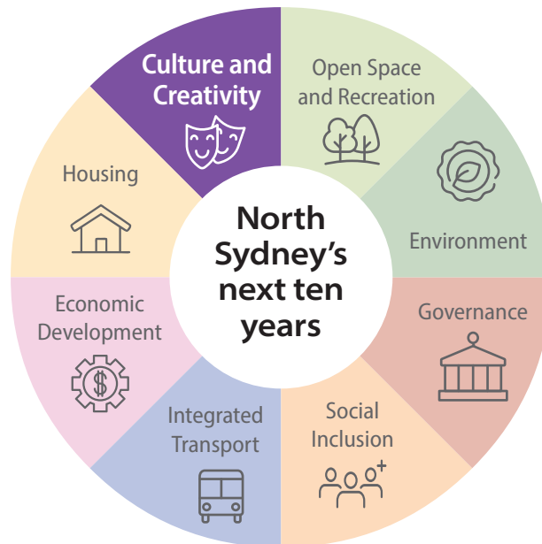
Figure 1: Suite of Informing Strategies

This strategy is part of a suite of informing strategies (see Figure 1) that articulate North Sydney's needs and priorities over the next ten years. These strategies will form the basis for Council's new Community Strategic Plan (CSP) 2025-2035, Delivery Programs and Operational Plans.