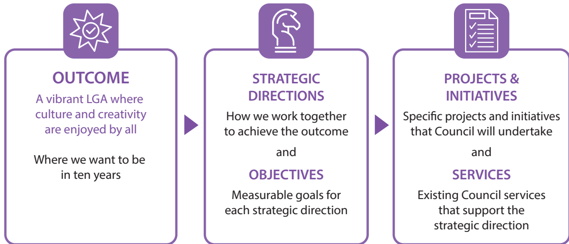
Figure 2: Structure of the Culture and Creativity Strategy

Figure 2 illustrates the structure of the informing strategy.